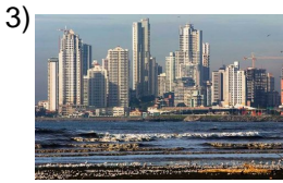
bigger and bigger