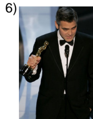
better and better