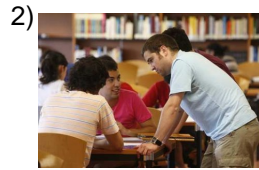
from bad to worse