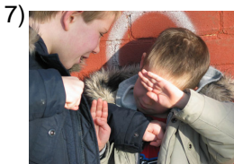
to bother, to bug