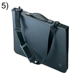
purse, pocket-book, portfolio