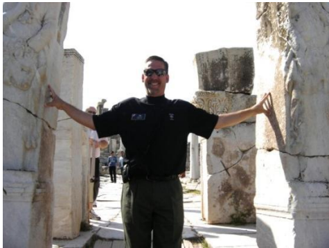
between, divided by