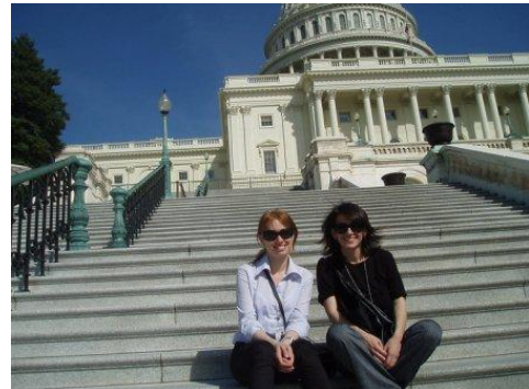
in front of