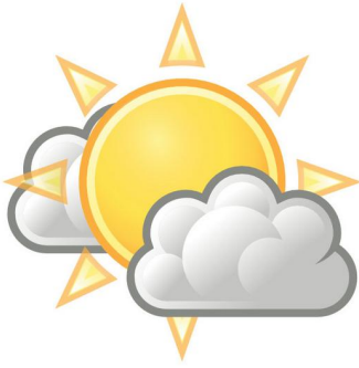
to be cloudy