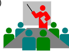
meeting, get together