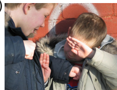
to bother, to bug