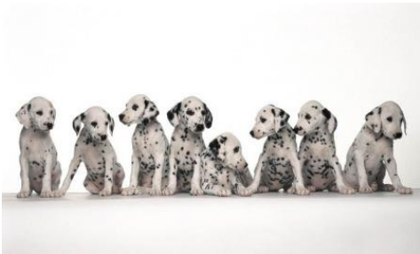
much, a lot