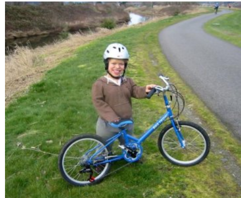
a short person