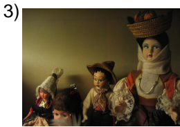
big doll, beautiful woman