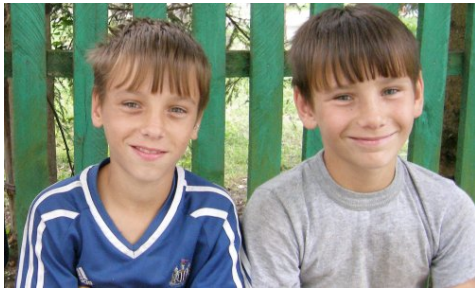
brothers or siblings