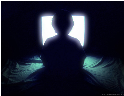
watch, to look