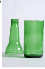
the bottle, jar