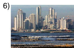
bigger and bigger