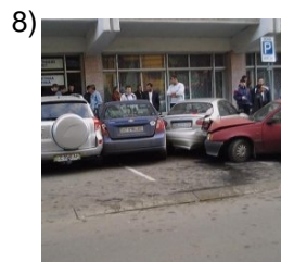
once and for all