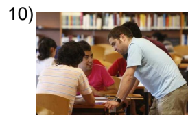
from bad to worse