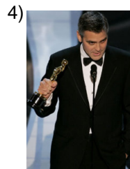
better and better