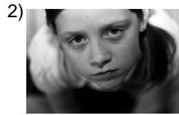
as it once