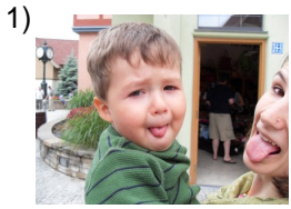
at the same time

Order all the letters and fill in the blank with the corrected word.