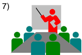
meeting, get together