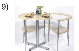
the little table