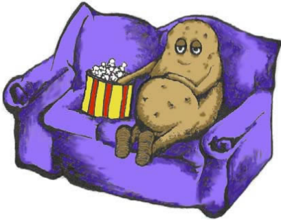
lazy, lazy person