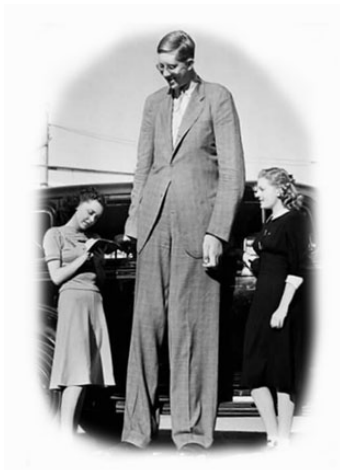
tall (masculine singular)