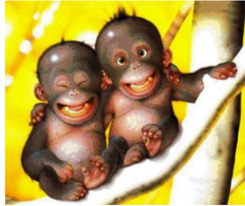
How are you?