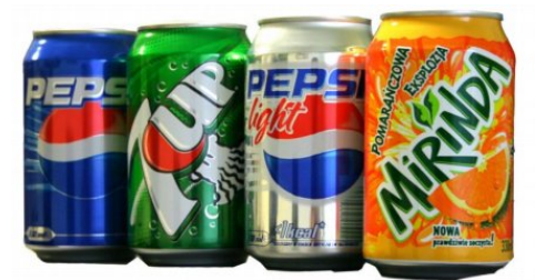
refreshments, soft drink