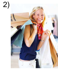
to go shopping