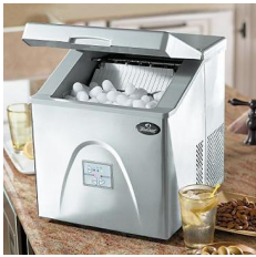
icemaker, portable cooler