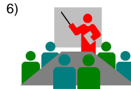
meeting, get together