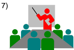
meeting, get together