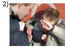
to bother, to bug