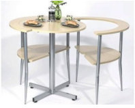
the little table