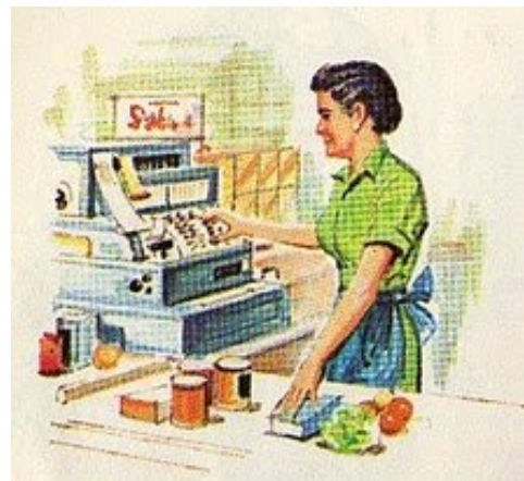
teller or cashier