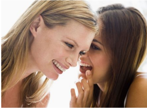
to talk/to speak