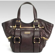
the bag, purse