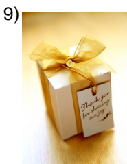
thank you very much