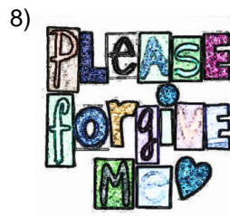
forgive me, excuse me