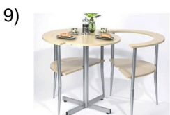
the little table