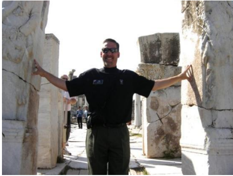
between, divided by