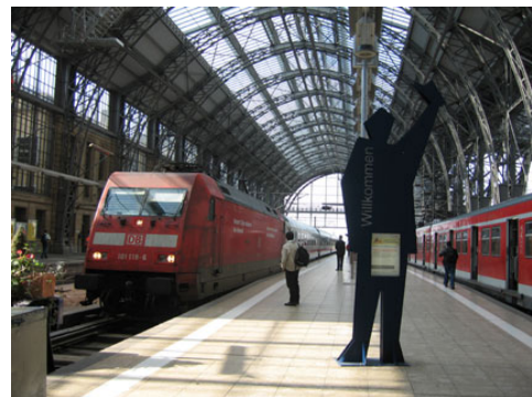
bus or train station